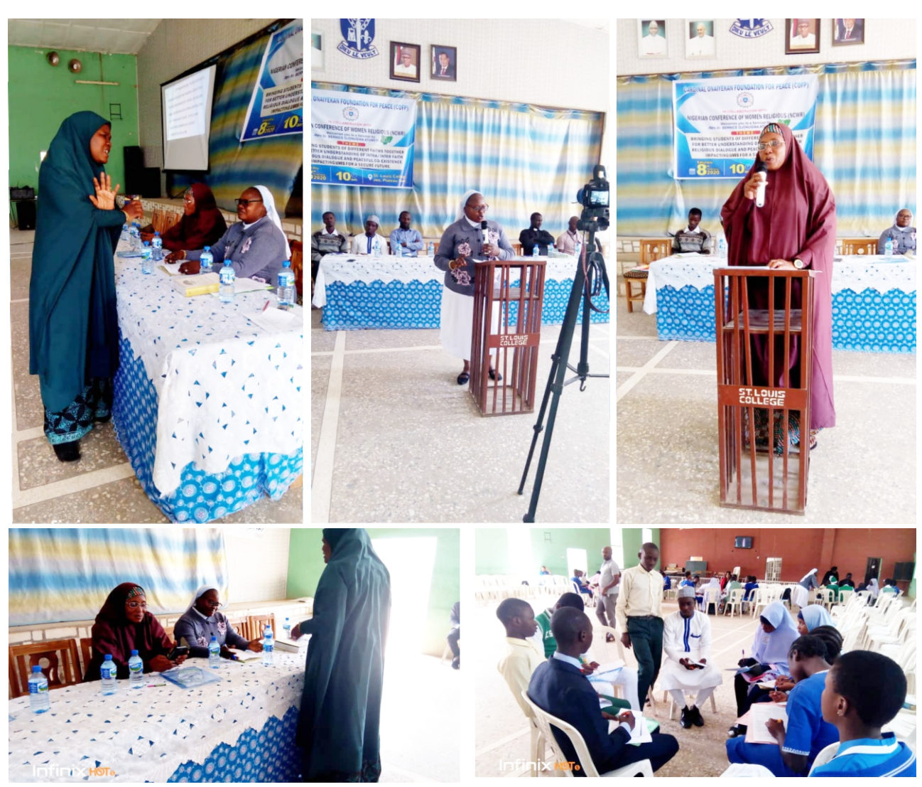
Uniting people of different faiths for peace through dialogue