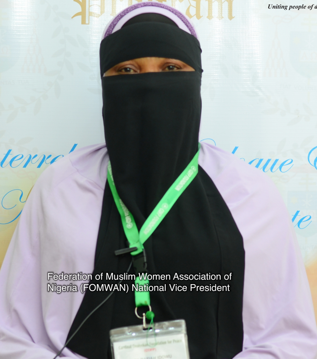
Federation of Muslim Women Association of Nigeria (FOMWAN) National Vice President