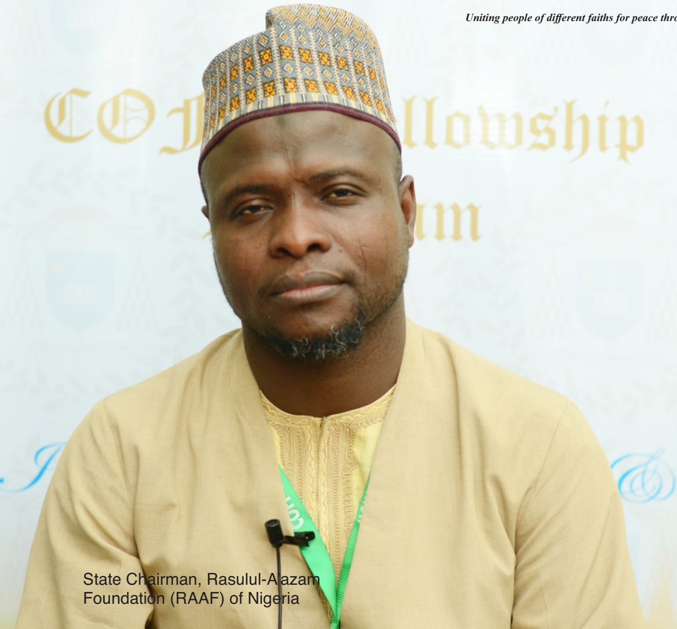
State Chairman, Rasulul-A'azzam Foundation (RAAF) of Nigeria