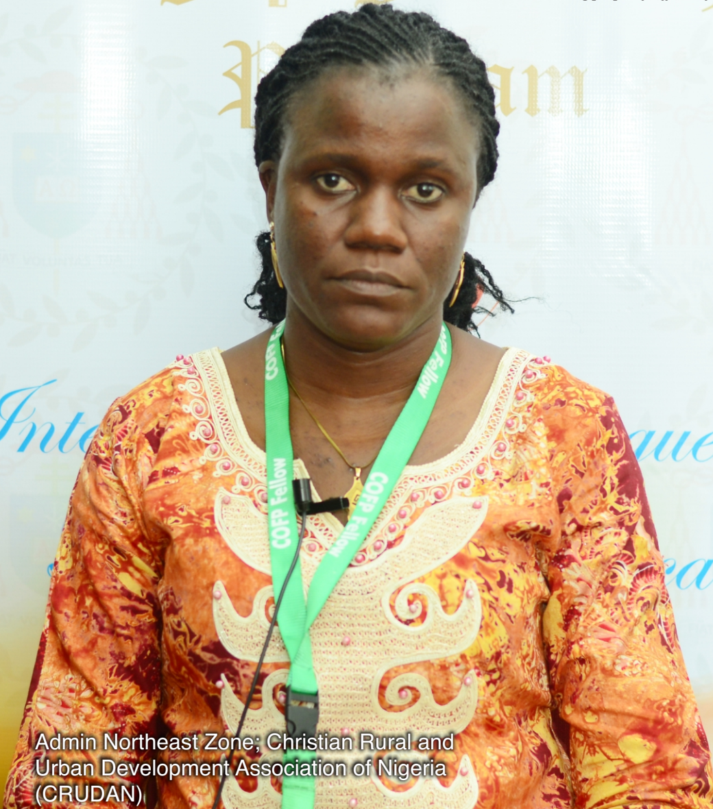
Admin Northeast Zone; Christian Rural and Urban Development Association of Nigeria (CRUDAN)