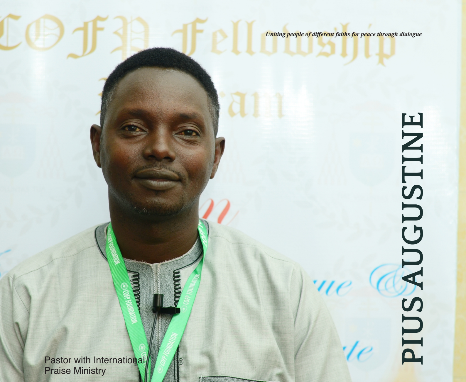
Pastor with International Praise Ministry