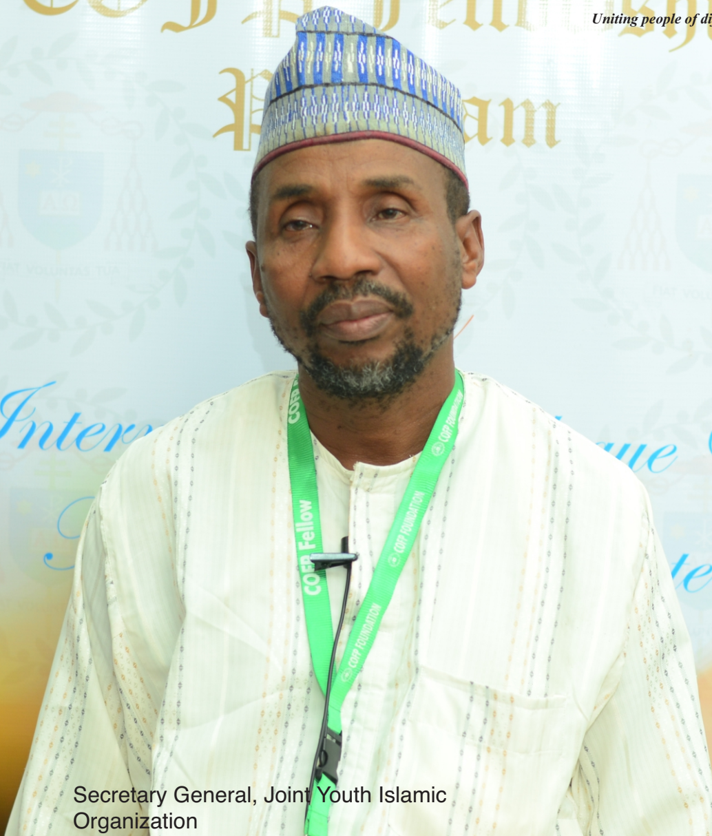
Secretary General, Joint Youth Islamic Organization