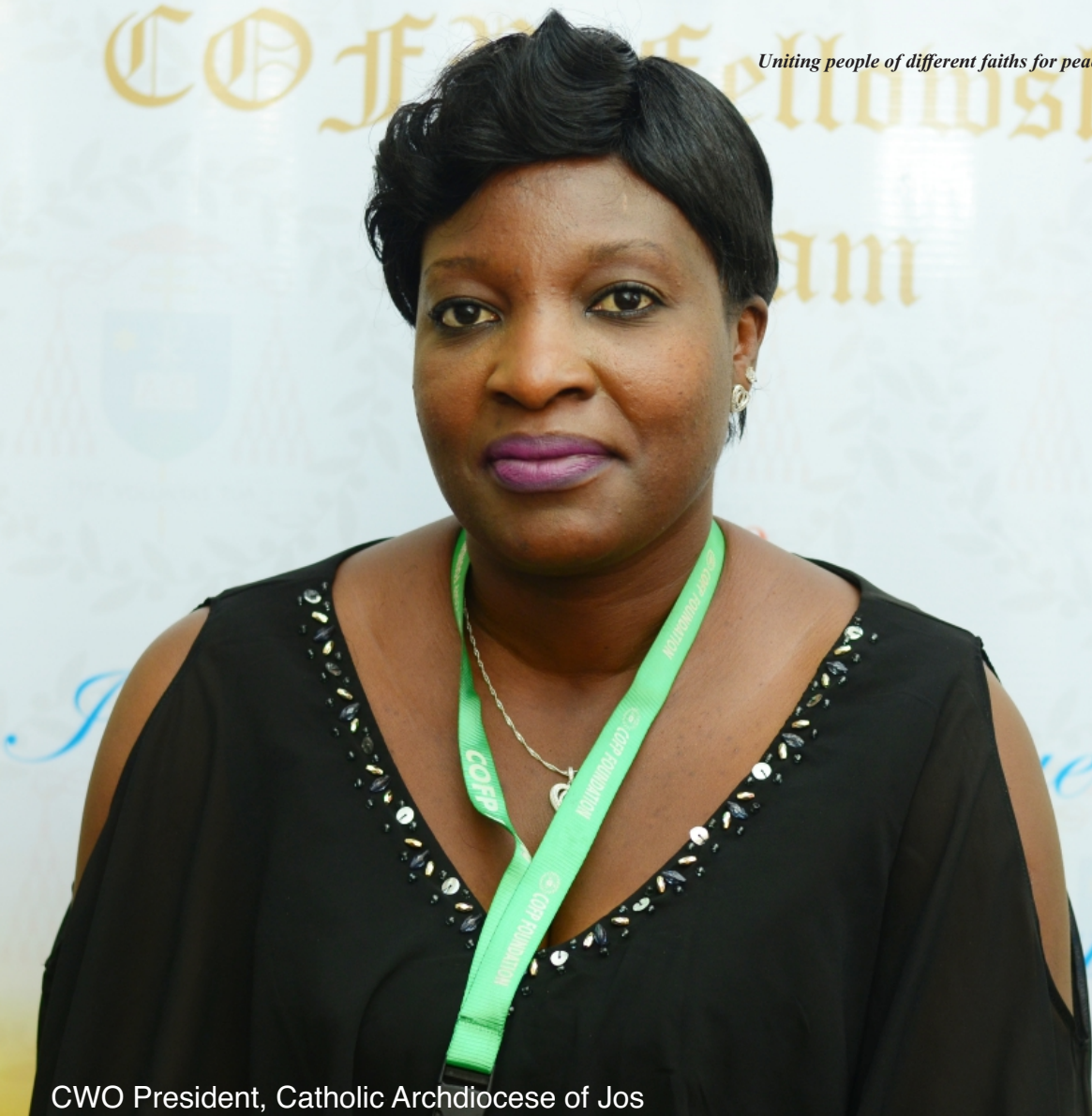
CWO President, Catholic Archdiocese of Jos