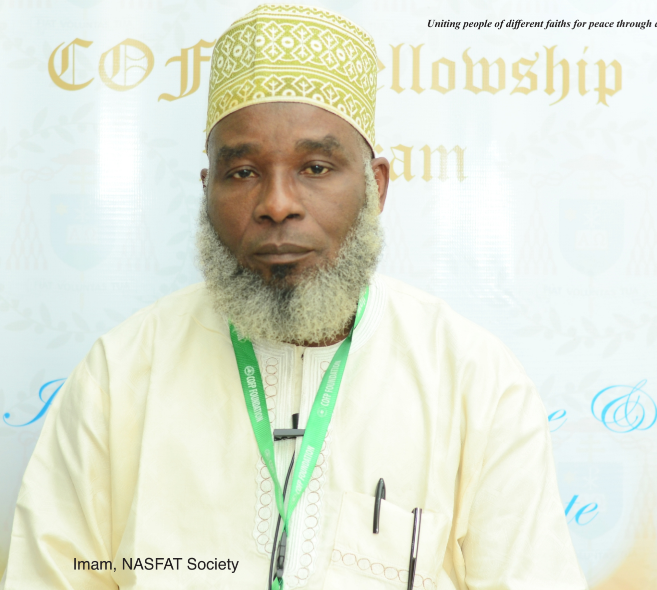
Imam, NASFAT Society